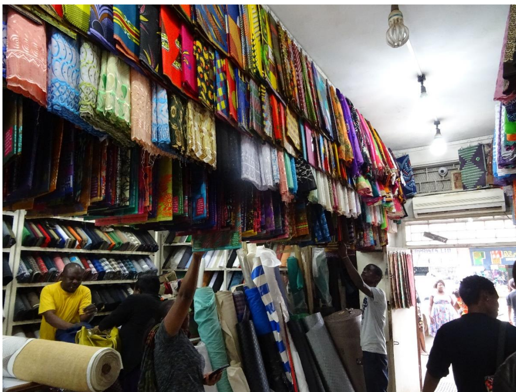
Material shop in Lusaka